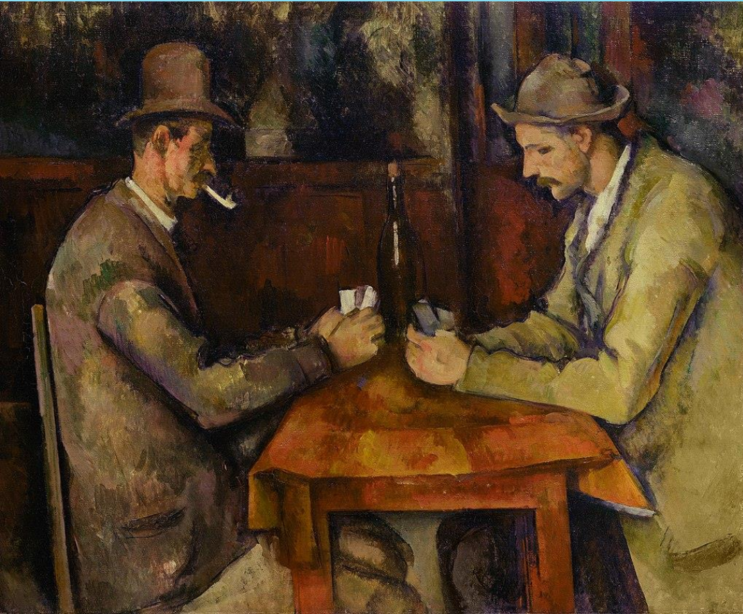
Les Joueurs de cartes, by Paul Cézanne - 1894-95 – “The Card Players”