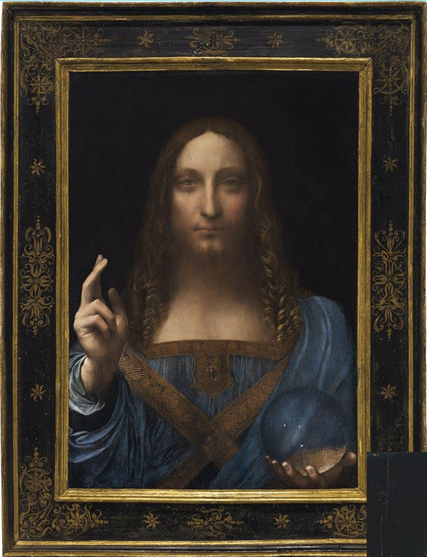
Salvator Mundi, by Leonardo da Vinci, c.1500 [restored above] 2006 – after cleaning [left]